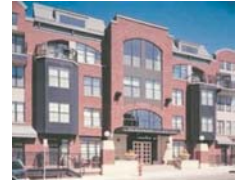
19 Mixed-Use Employment Focus High-Rise