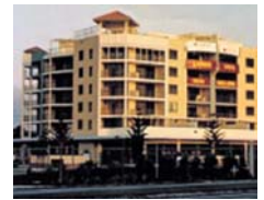
21 Mixed-Use Retail/Office Mid-Rise