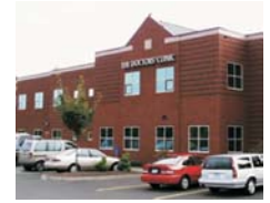
10 Mid-Rise Office