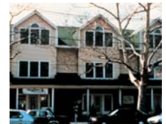
16 Mixed-Use Residential Focus Mid-Rise (Owner)