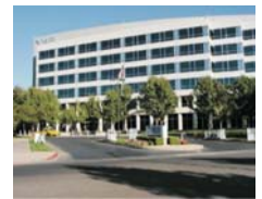
11 High-Rise Office