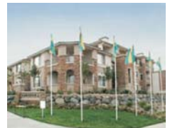
6(R) Low-Rise Apartments (Rental)