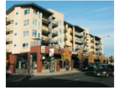
17 Mixed-Use Residential Focus High-Rise