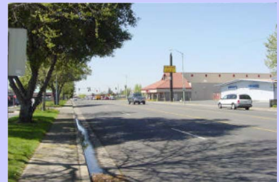
East Bidwell at Wales