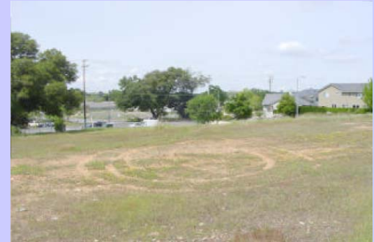
Vacant land at Glenn and Sibley