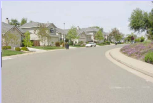
New single family homes and adjacent park, looking North on Cobble Ridge