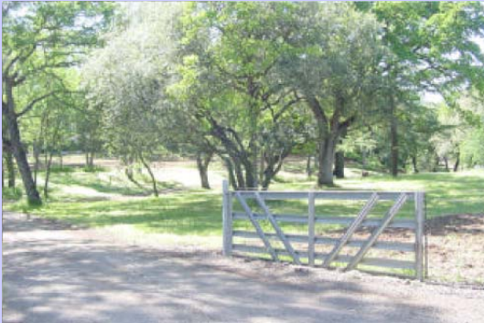
Vacant land, looking West from Sibley near Emerald Stone