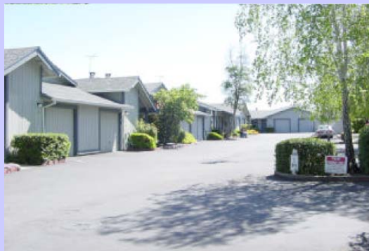
Apartments looking South from Bidwell