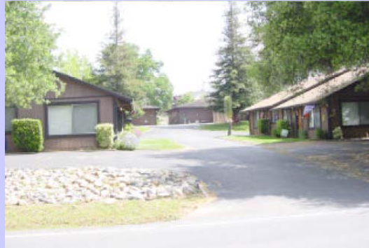
Apartments on Sibley at Brilliance