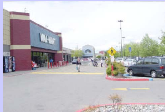
Large retail center at Glenn and Riley