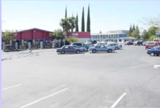
Bowling Alley on Riley, West of Glenn