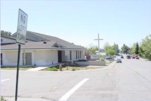
Church at corner of Scott and Natoma