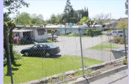
Mobile home park at corner of Folsom and Natoma