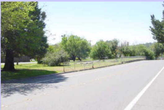
Historic cemetery and park facing Southwest on Natoma at Sibley