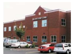
10 Mid-rise Office