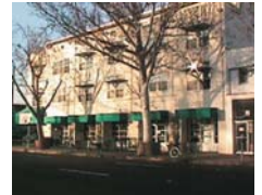
18 Mixed-use Employment Focus Mid-rise