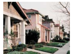
14 Mixed-use Horizontal