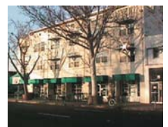
18 Mixed-use Employment Focus Mid-rise