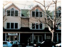
16(O) Mixed-use Residential Focus Mid-rise (owner)