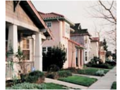
14 Mixed-use Horizontal