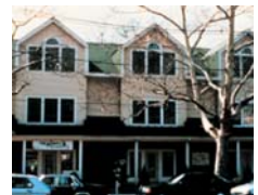
16(O) Mixed-use Residential Focus Mid-rise (owner)