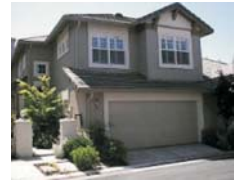
3 Medium Lot Single Family Residential