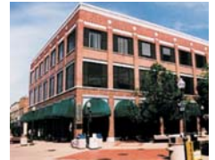
20 Mixed-use retail/ Office Mid-rise