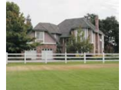
1 Rural Residential