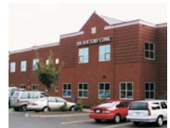
10 Mid-rise Office