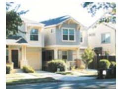
4 Small-lot Single Family Residential