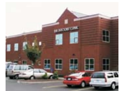
10 Mid-rise Office