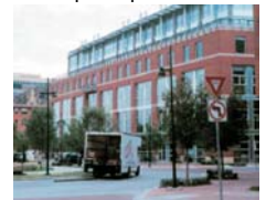
24 Public/Civic/ Education