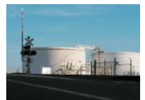
23 Heavy Industrial