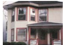
4 Small Lot Single Family Residential