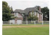
1 Rural Residential