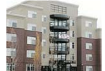
8 High-Rise Condos