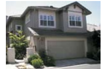
3 Medium Lot Single Family Residential