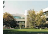
10 Mid-Rise Office