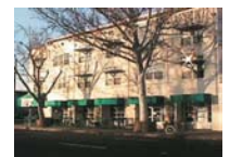
18 Mixed-Use Employment Focus Mid-Rise