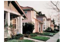
14 Mixed-Use Retail / Residential Horizontal