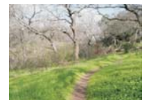
25 Open Space