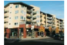
17 Mixed-Use Residential Focus High Rise