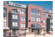
19 Mixed-Use Employment Focus High-Rise