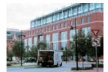
24 Public / Civic / Education