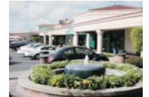
12 Community / Neighborhood Retail