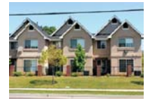
6 Low-Rise Condos