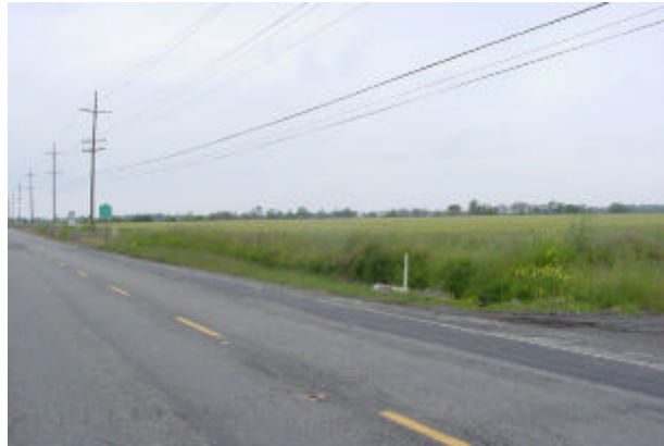
4 - Looking Southwest from Pole Line from Northeast corner of study area