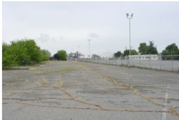
10 - Parking lot at vacant light industrial facility