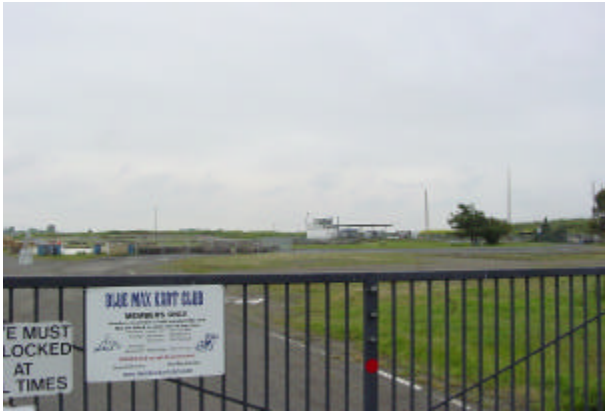
3 - Go-cart racetrack just North of study area