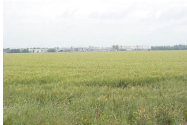
3 - Looking West across agricultural land, light industrial facility in background