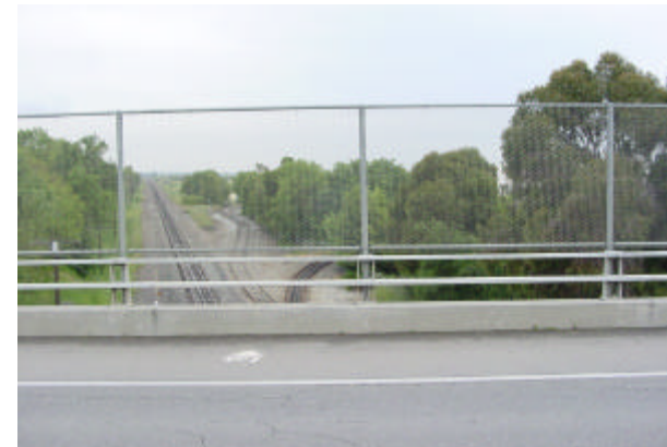
12 - Looking North from rail overcrossing