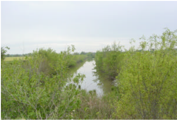
1 - Looking South along canal adjacent to County Rd 101A