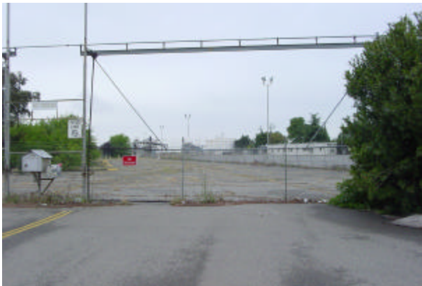
9 - Entrance to vacant light industrial facility, looking North from Covell