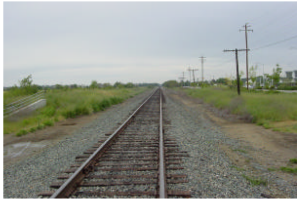
2 - Looking South on RR tracks adjacent to County Rd 101A