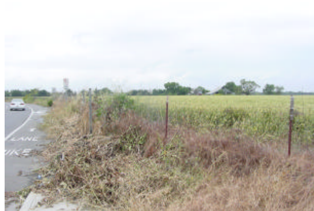
5 - Park near terminus of 24th Street