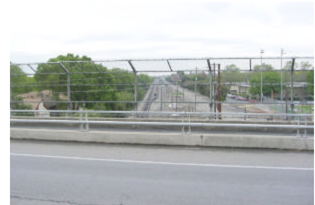
13 - Looking South from rail overcrossing