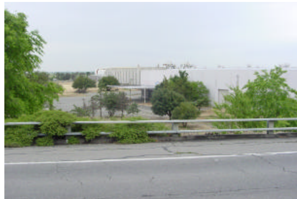
11 - Back of vacant light industrial building on Northeast corner of Covell & 101A