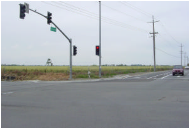
9 - Looking Northwest from Pole Line & Covell intersection