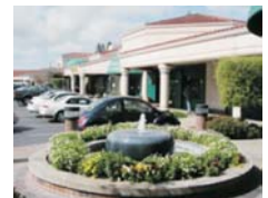
12 Community/ Neighborhood Retail