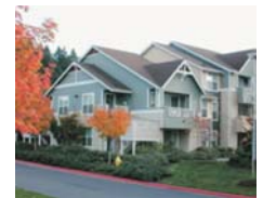
7 Mid-Rise Condos