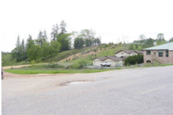
3 - Vacant parcel on Southwest corner of Whitcomb & Placer Hills