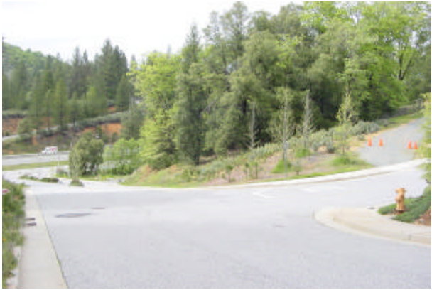
12 - Looking East toward Canyon & 1-80 from area of new development