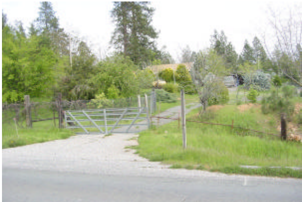
4 - Single family residence on eastern side of Canyon