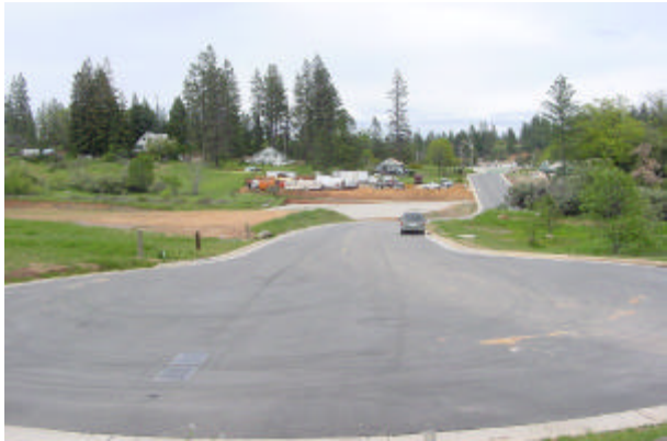
1 - New construction on cul-de-sac terminus of Whitcomb