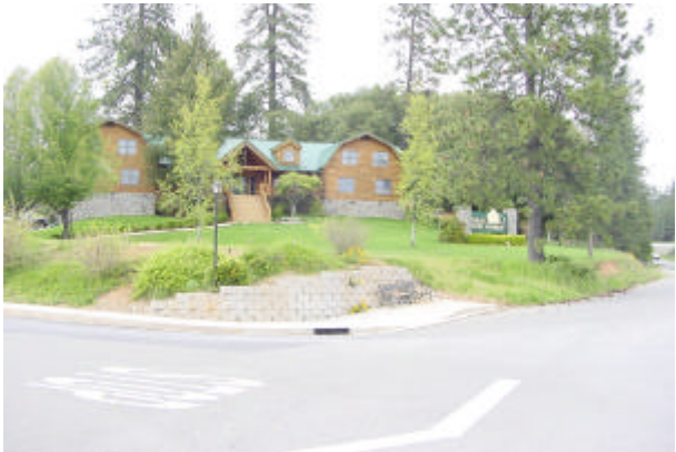
5 - Office on Northwest corner of Mink Creek & Placer Hills