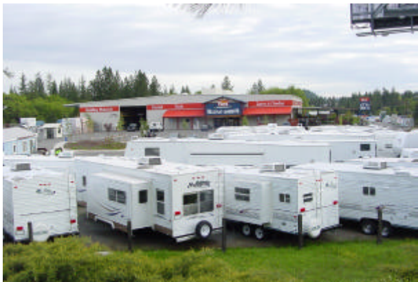
7 - RV sales and hardware store on cul-de-sac East off Canyon