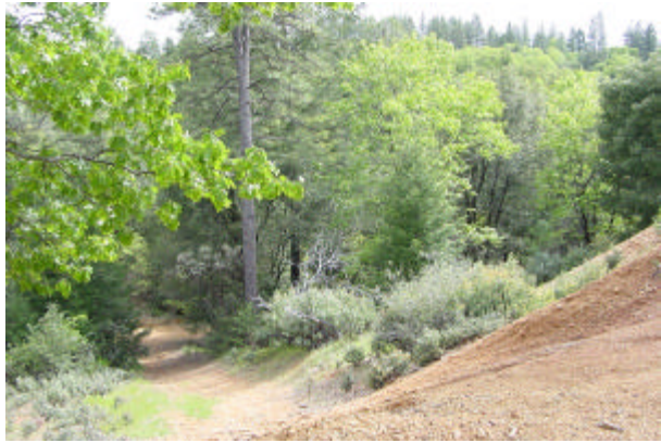
13 - Vacant parcel adjacent to new home development