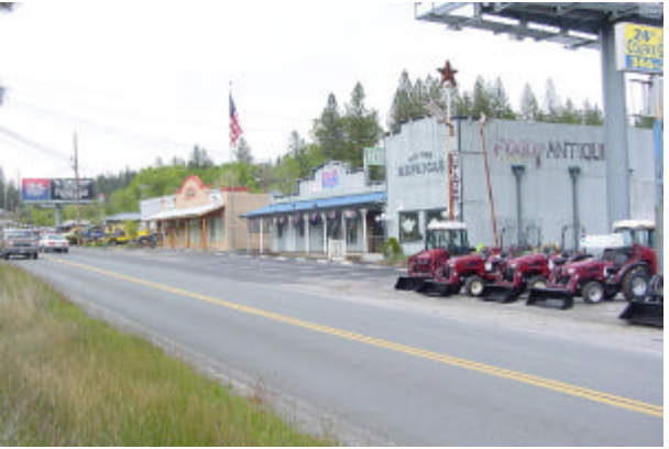
10 - Retail, looking Northeast along Canyon