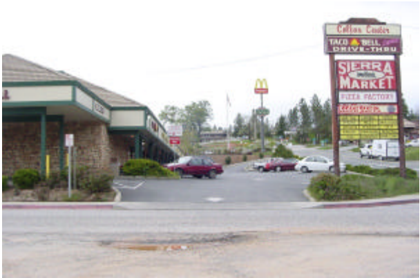
2 - Retail center looking north from Whitcomb along Placer Hills