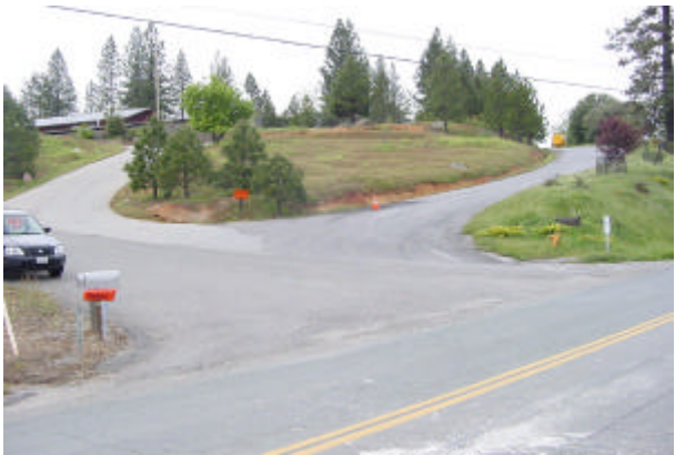
8 - Looking North from Placer Hills toward construction yard