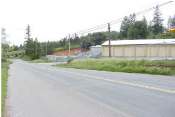
6 - Looking Southwest from Mink Creek along Placer Hills