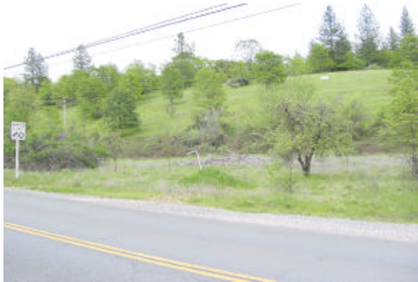
9 - Large vacant parcel, looking East from Canyon