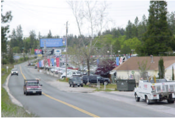
11 - Canyon looking North