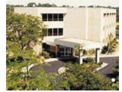
21 Mixed-Use Retail/ Office High-Rise