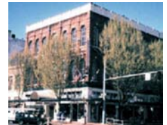
20 Mixed-Use Retail/ Office Mid-Rise