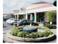
12 Community/Neighborhood Retail