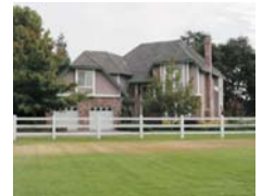
1 Rural Residential