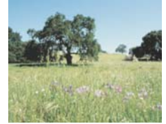
25 Open Space