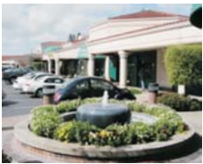
12 Community / Neighborhood Retail