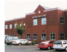
10 Mid-rise Office