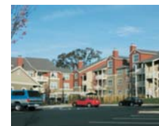
7(O) Mid-rise Condos (owner)