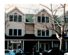
16(O) Mixed-use Residential Focus Mid-rise (owner)