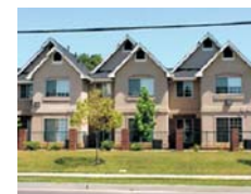
6(R) Low-rise Apartments (rental)