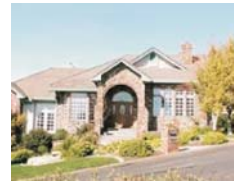
2 Large-lot Residential