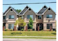
6(R) Low-rise Apartments (rental)