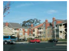
7 Mid-rise Condos