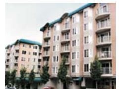
8 High-rise Condos