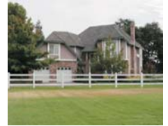
17(R) Mixed-use Residential Focus High-rise (rental)