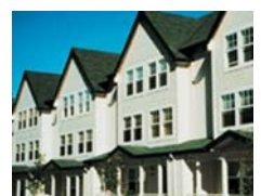
5(R) Townhouse (rental)