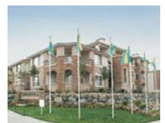
6(R) Low-rise Apartments (rental)