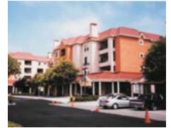
16(R) Mixed-use Residential Focus Mid-rise (rental)