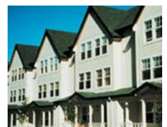
5(R) Townhouse (rental)