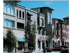
18 Mixed-use Employment Focus Mid-rise