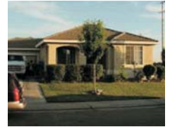
2 Large-lot Single Family Residential