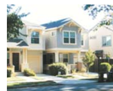
4 Small-lot Single Family Residential