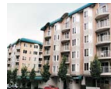
8 High-rise Condos