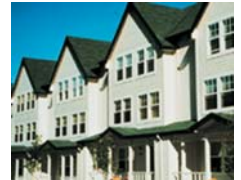
5(0) Townhouse (owner)