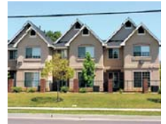
6(R) Low-rise Condos (rental)