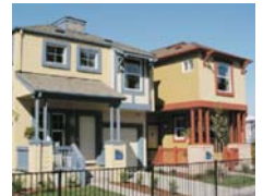
5(R) Townhouse (rental)