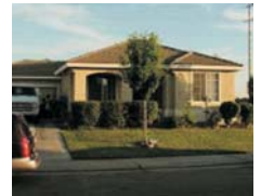
2 Large-lot Single Family Residential