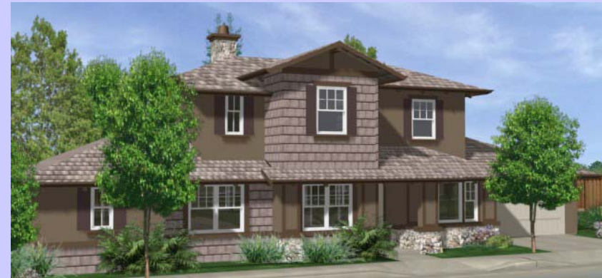
3,500 sq. ft. lots