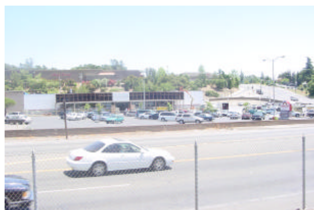
11 - Retail center undergoing renovation, at Fulweiler & State Route 49