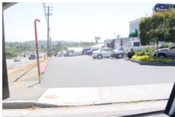
7 - Retail strip along State Route 49, looking South toward I-80