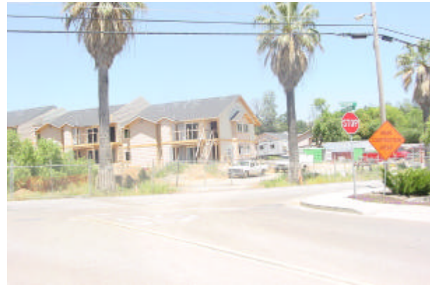
3 - Multi-family housing, under construction