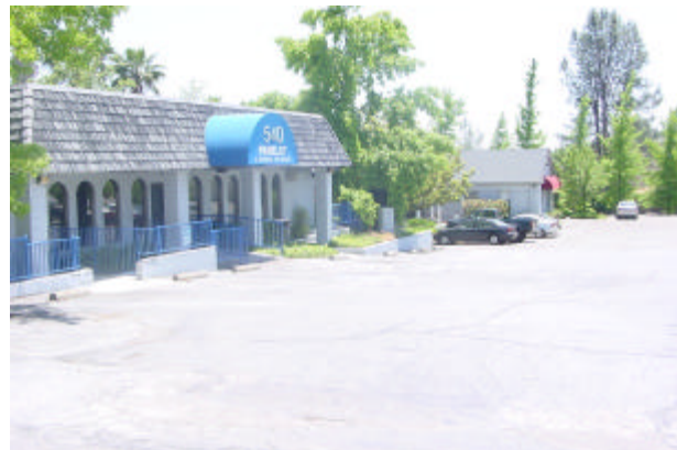
5 - Dance school in retail/commercial area