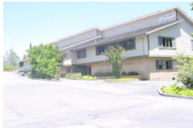
6 - Vacant office building