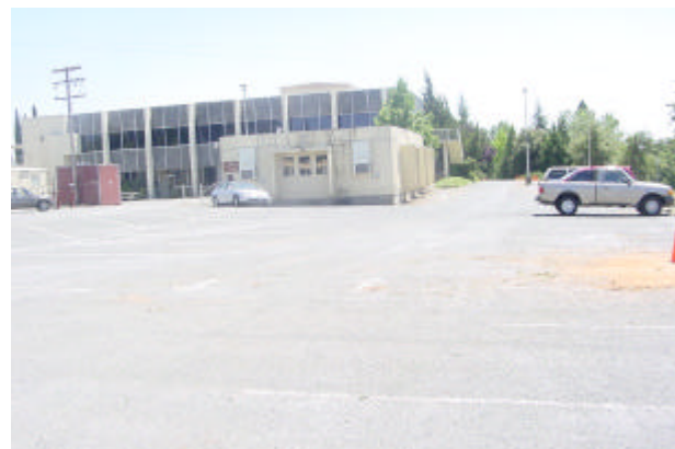
9 - Office complex currently being renovated for County offices