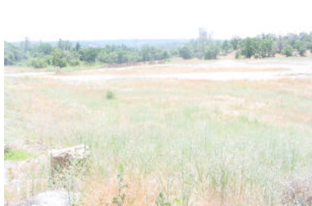
1 - Vacant land, currently used for disposal of dirt & gravel