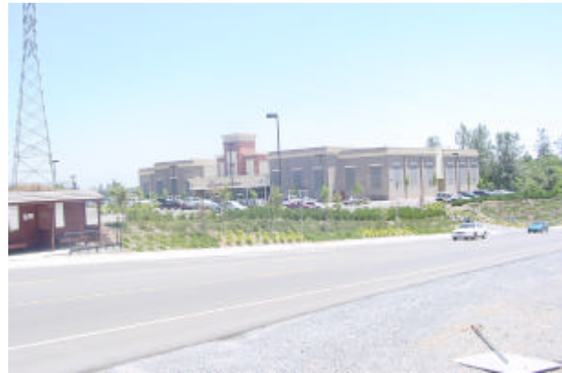
2 - New multi-screen theater