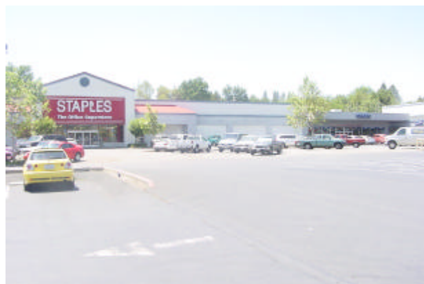
10 - Renovated retail center at State Route 49 & Fulweiler