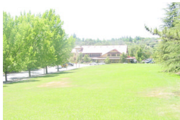
12 - New office building