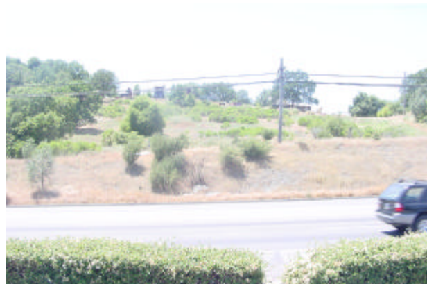
4 - Vacant lot along State Route 49