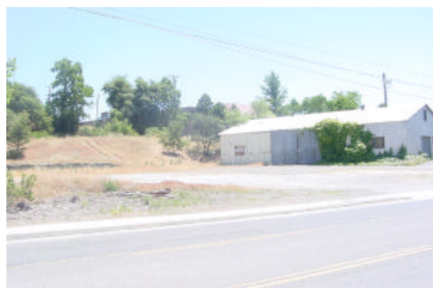
8 - Old warehouse, adjacent to vacant land & other warehouses