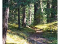
28 Urban Reserve