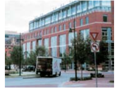
24 Mid-Rise Office