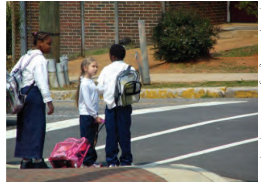
Right: photo courtesy of Dan Burden Left: www.pedbikeinfo.org/Portland Bureau of Transportation