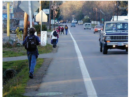
Right: photo courtesy of Michael Rankin Left: photo courtesy of League of Illinois Bicyclists

These children clearly do not have a safe route to school. The incomplete streets pictured make their trip unappealing and unsafe.