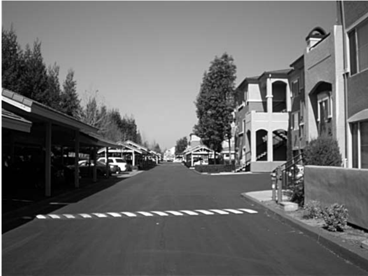
Photo 1. Contrasting Road Designs Alborada Apartments (above) and Archstone Fremont Center (below)

less of a physical presence: podium parking is tucked under four-story residential complexes, with less than half the site devoted to parking and roadways.