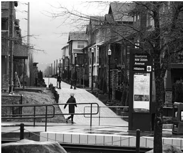
Photo 3. Pathway from the Quatama Station toward nearby residences

In sum, the Archstone and Alborada cases suggest that the presence or absence of mixed uses, direct pathways, and connectedness to surroundings could very well affect how TOD residents use and park their cars. The Quatama MAX station in Beaverton, Oregon, can serve as a model for cities such as Fremont on designing for transit connectivity. There, a walking path provides direct and nicely-landscaped access to the MAX station (Photo 3). The city required the project developer to build the path as a condition of approval. Retrofitting current development with such pathways, while challenging, could improve current pedestrian connectivity, and requiring such pathways in new developments could ensure better connectivity in the future.