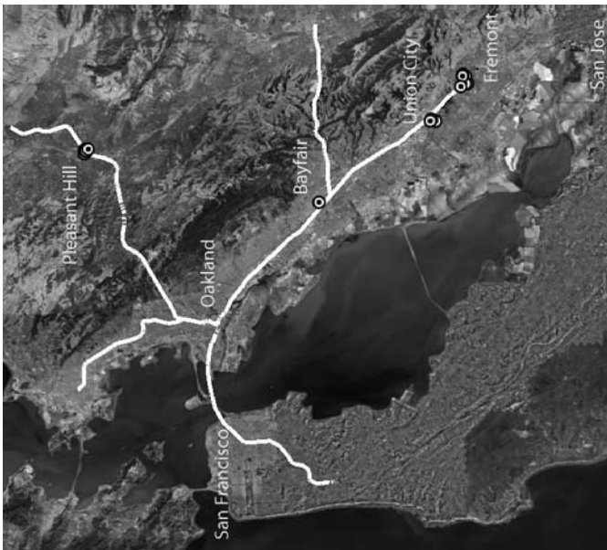
Figure 1. (cont'd.) East Bay Results: Peak Parking Generation Rates (Parked Vehicles per Dwelling Unit) Relative to Supply Levels and ITE Standard